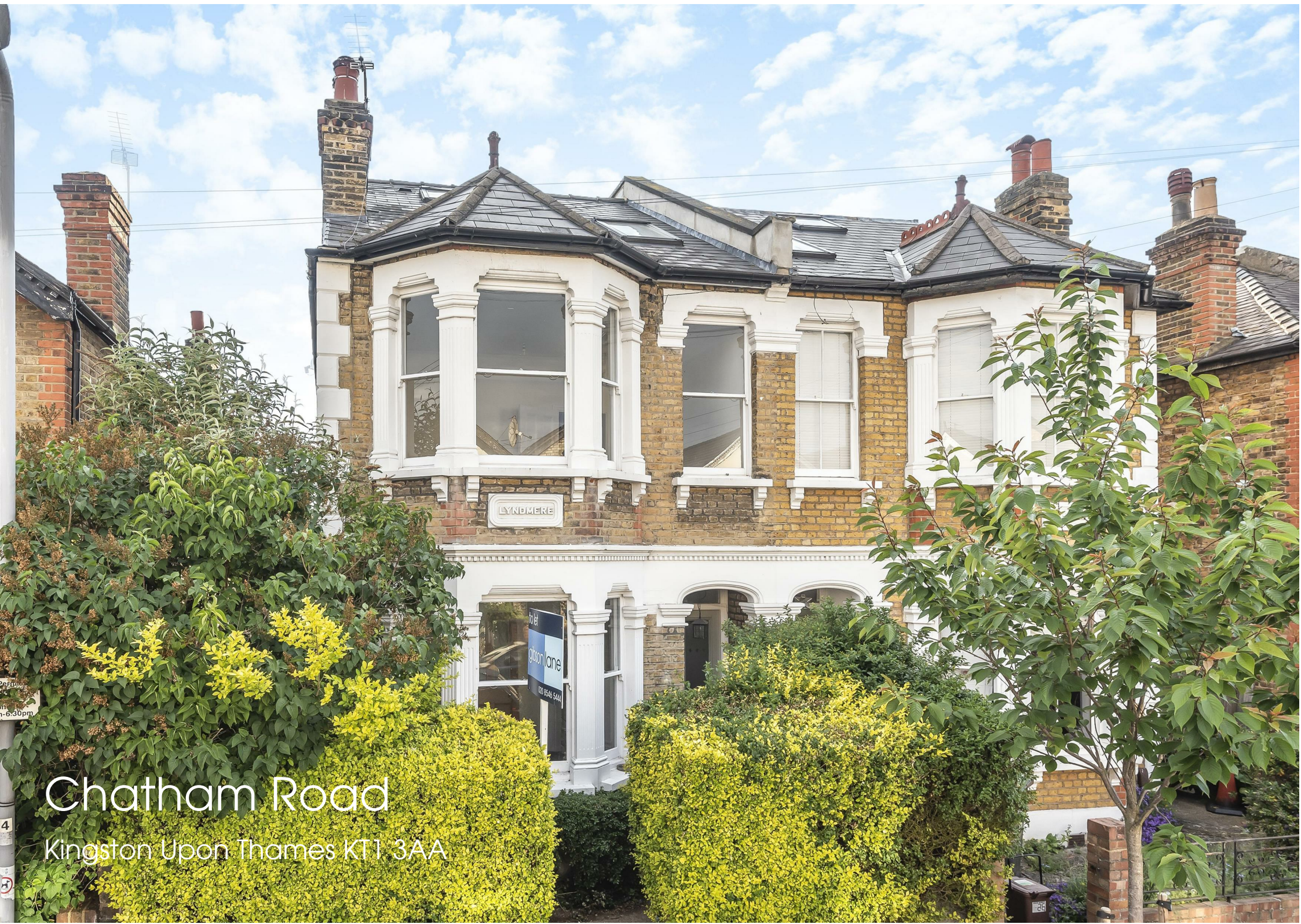
Chatham Road Kingston Upon Thames KT1 3AA